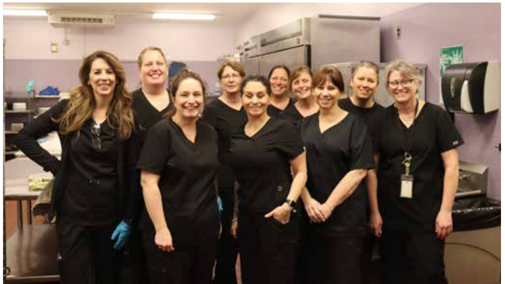
We are grateful for our amazing food service staff members!

welcome break to fuel up and boost our energy. We hope this article makes an impact and encourages Food Services to continue to offer these delicious meals. We all want to make a difference, even small ones. With one small difference at a time, we can all work to leave an impact. And with that impact, we can all change the world.