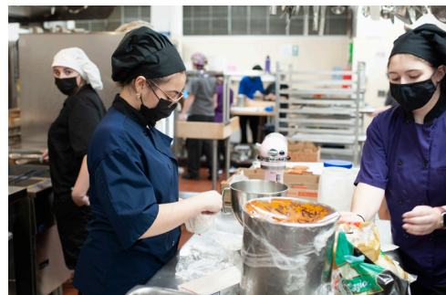
Culinary Arts students busy in the kitchen